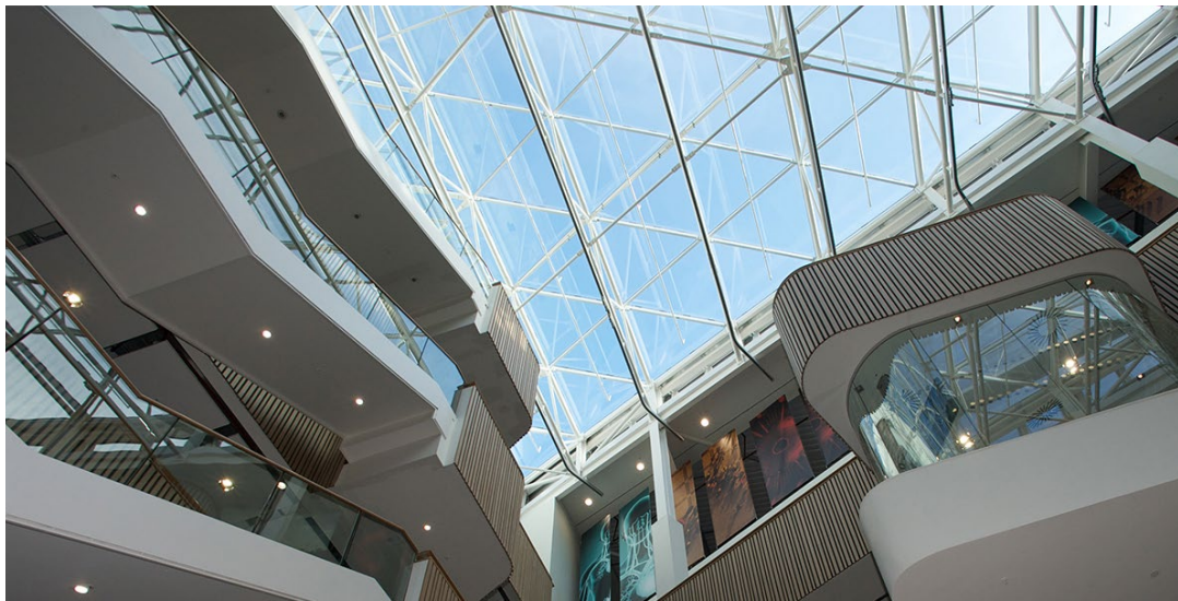
Technology and Innovation Centre at the University of Strathclyde